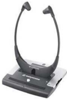
Hearing Assist Headphone

The courtrooms are capable of providing hearing assistance devices. Headphones are available, upon prior request, to enhance the audio provided in the courtroom. The headphones have volume control features for the user to adjust to their specific need.