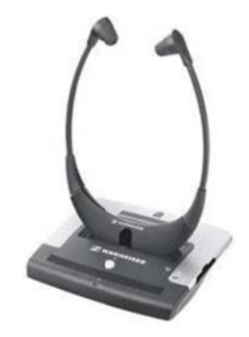
Hearing Assist Headphone

The courtrooms are capable of providing hearing assistance devices. Headphones are available, upon prior request, to enhance the audio provided in the courtroom. The headphones have volume control features for the user to adjust to their specific need.